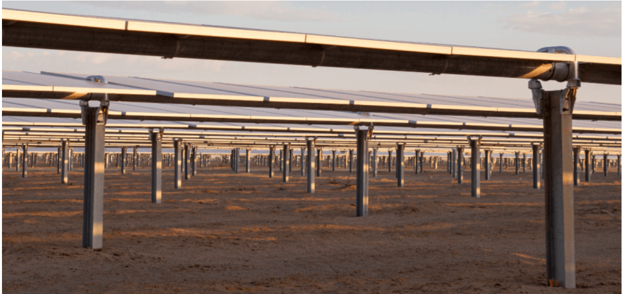
Figure D. Array of solar panels, oriented north-south.