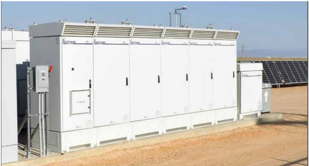
Figure E. Inverters are spaced throughout the project to convert the DC power to AC power.

Inverters convert the direct current (DC) power produced by the solar panels to alternating current (AC) power that is used in homes and businesses. Inverters, measuring approximately 19 feet long by seven feet tall by three feet deep (Figure E), are installed on concrete pads throughout the project. Solar facilities' designs locate the Inverters away from the project perimeter and adjacent properties.