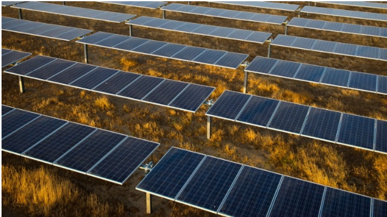
Figure A. Array of solar panels, oriented north-south.

Typically, each array consists of several dozen rows, with each row containing 80 portrait-oriented solar panels running north-south and each panel measures 78 inches by 39 inches or two meters by one meter (Figure A). (Some racking manufacturers allow for half or three-quarters sized rows.) The solar panels are mounted on single-axis tracking steel tubes powered by a motor with 24 volts of direct current (VDC). For each row, typically one small, dedicated solar panel powers the motor (Figure B). Depending on the slope and other site constraints, the solar facility's design will space the rows between 15 feet and 20 feet apart (Figure C). Driven "H" piles spaced 25 feet apart support the rows of panels and tracking steel tubes (Figure D). Manufacturers design their racking systems to withstand 100 miles per hour (mph), three-second-wind gust (ASCE 7-10). The entire array is a self-grounding structure.