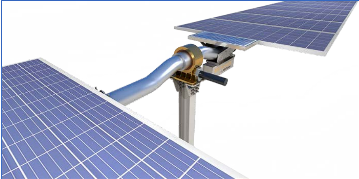
Figure B. Self-powered controller with one small, dedicated solar panel per row.